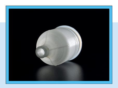
Pressure vessel component made of Radilon® Adline CS