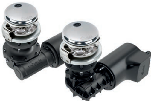
Replacement of metal housing (left) with engineering polymer housing (right)